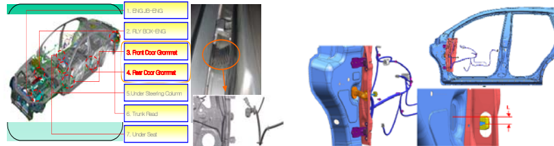
Fig. 1. Automotive front door wiring harness (W/H) system: open/close position

Without connection system, no system will work; it will play vital role any industry whether in automotive. The main function of the connection system is to distribute the power supply from one system to another system.